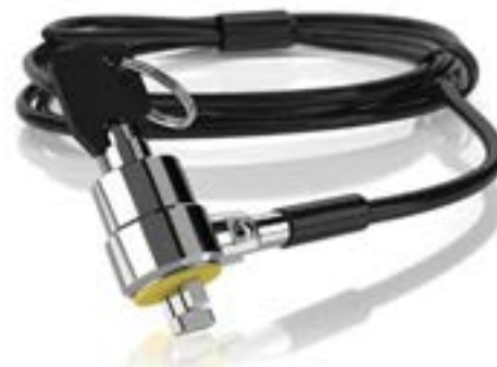
Stand Security Cable