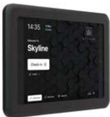
iPad Pro / iPad White / Black