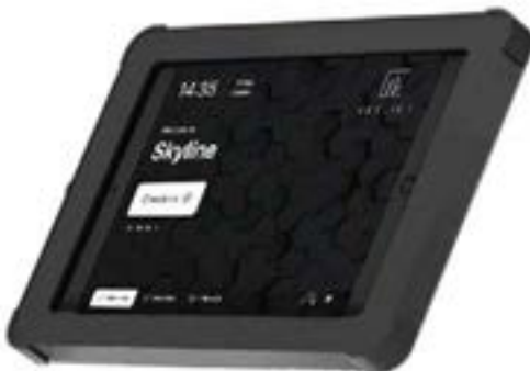
Replacement Kiosk Head