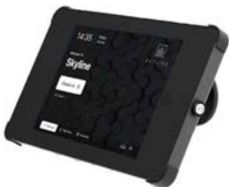
iPad Pro / iPad Black only