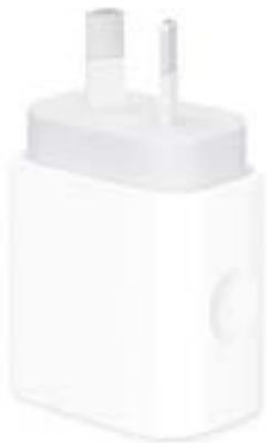
iPad Power Adapter