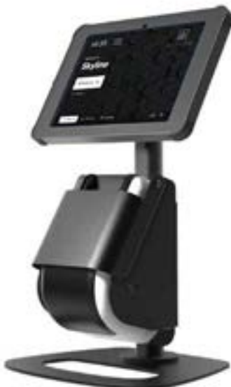
iPad Pro / iPad Black only