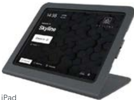
iPad Pro / iPad Black only