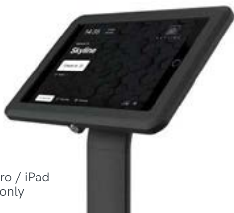
iPad Pro / iPad Black only