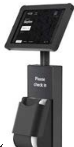
Custom Branded Artwork